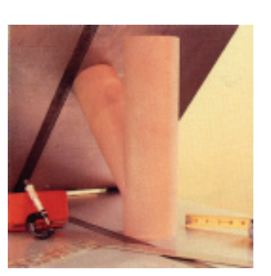
Angle standard being used to check the dimensional requirements of prefabricated piping items.