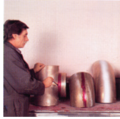
Liquid penetrant examination locates surface defects which may be too small to see visually.