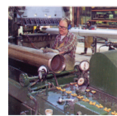
Hydrotesting testing checks for leaks and structural integrity.