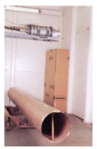
Radiographic inspection checks the integrity of welds.