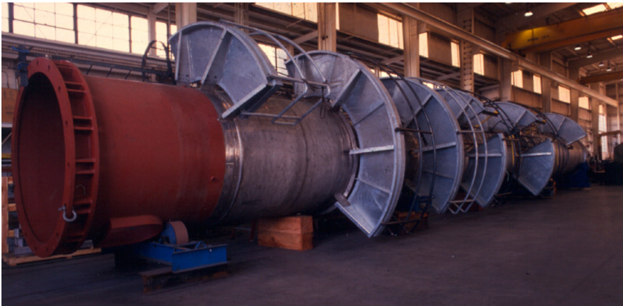
Extractor tower, 90" diameter x 1/2" wall x 83 ft. high with prefabricated platforms, fabricated from Type 304 stainless steel for the petrochemical industry.