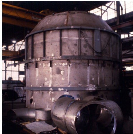
Vapor recompression evaporator sump used in the wastewater treatment industry.