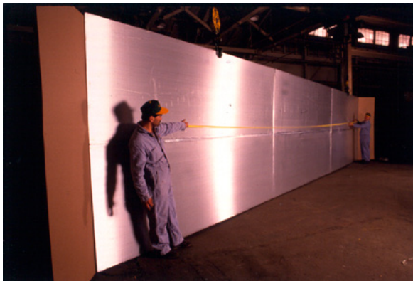
Tank shell for the food processing industry made into one continuous piece using automatic splice welding prior to rolling.