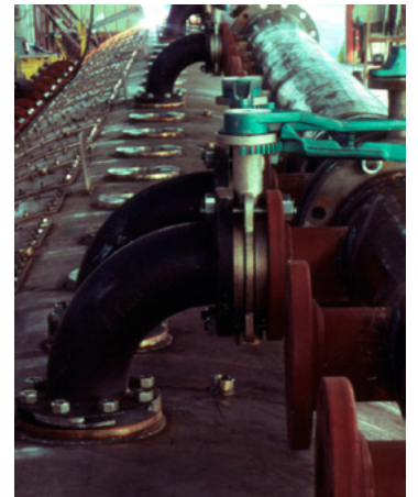
Stainless steel multi-tray column used in the chemical industry.