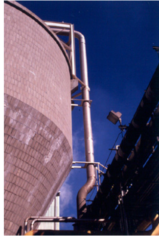
24" diameter stainless steel pipe used in the pulp and paper industry to load pulp into a bleached pulp stock chest.

Extensive experience in engineering and producing complex fabrications and prefabricated piping systems has helped Alaskan Copper Works build and maintain a strong reputation for capability, quality and dependability.