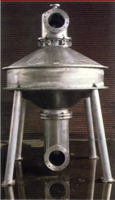
Aluminum wet pump pressure vessel used to transfer fish from a ship's hold to the dock.