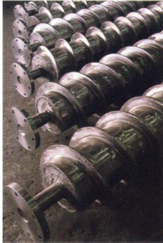
Stainless steel screw conveyors used for food processing.