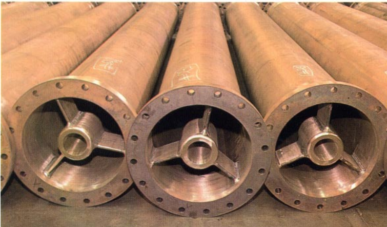
Coper-nickel pipe used in of-shore sulfur mining as a seawater supply line and pump shaft support.