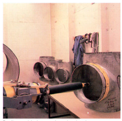
Radiographic inspection checks the integrity of welds.