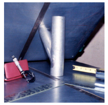
Angle standard being used to check the geometric accuracy of prefabricated piping items.