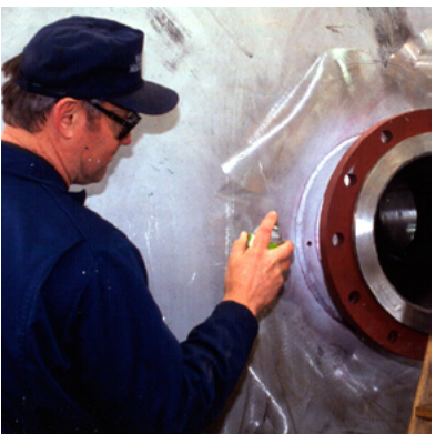
Liquid penetrant examination locates hidden surface defects which may be too small to see visually.