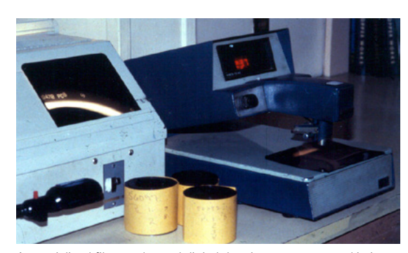
A specialized film reader and digital densitometer are used in interpreting radiographic film.