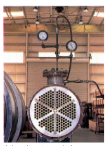
Hydrostatic testing checks for leaks and structural integrity.